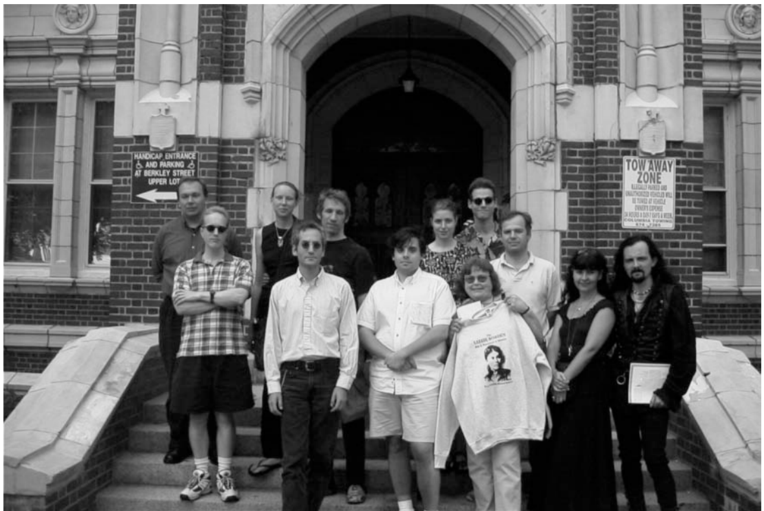
Some of the attendees at the July Cthulhu Prayer Society outing in Fall River, MA